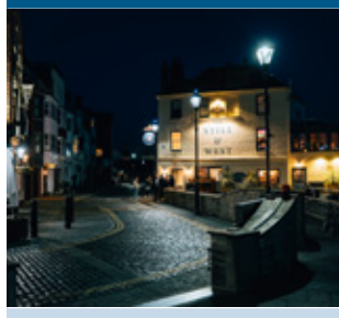
Traditional English pubs, restaurants and tea rooms in the historic cobbled streets of Old Portsmouth.