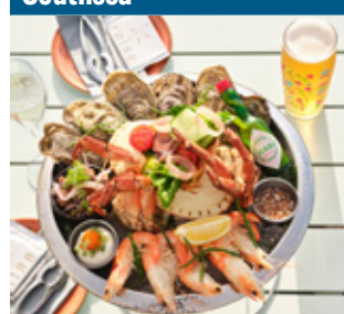
Great range of independent restaurants and bars offering food from across the globe - including seafront eateries and fish and chip restaurants.