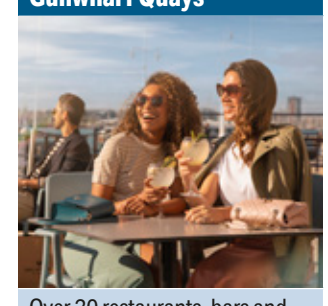
Over 30 restaurants, bars and coffee shops offering a range of menu options, many with waterside views.